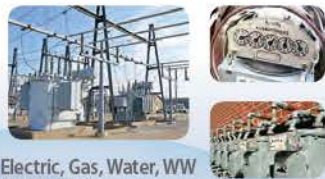
Electric, Gas, Water, WW (AMR, AMI)