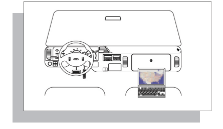
TRAKIT™ - SUPERVISOR MONITOR

Monitor the locations of all your fleet vehicles, realtime. Direct their activity using FleetSync™ messaging. Dispatch closest vehicle to the job. Set zone alerts for efficiency and safety. Includes exclusive Point&Click landmark data feature.